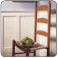
Classic American ®