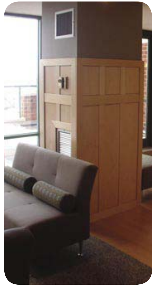
Classic Modern features flat panels that capture the rich wood grain detail, while precision machined panel edges achieve a shadow reveal between rail, stile and panel. Inspired by the work of Louis Kahn and Alvar Alto this dynamic system belongs in a Modern or Contemporary setting.