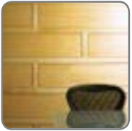
Classic Modern ®