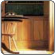
Classic Traditional ®

New England Classic systems are available in four design styles to complement noteworthy architectural periods of the past four hundred years: