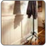
Classic Beadboard ®